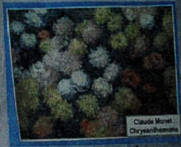
Claude Monet Chrysanthemums